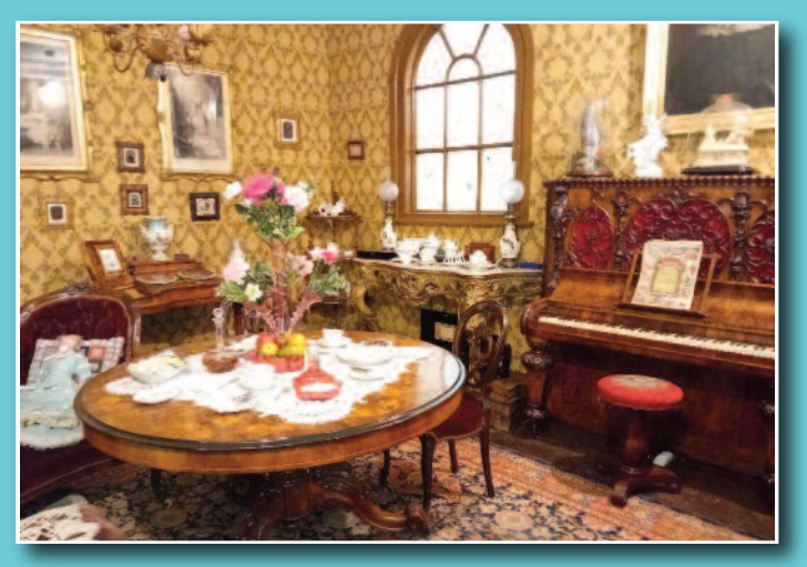
In all a brilliant day out.

We can still only afford one servant, a maid of all works. She does well with all the heavy work considering she is only 15.